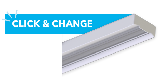
LED linear system FastFix R UniversalFit