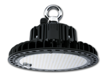
LED highbay luminaires series FL