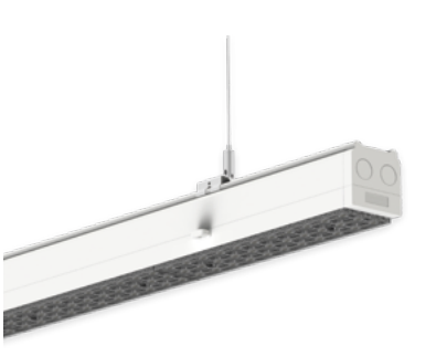
LED linear system FastFix S