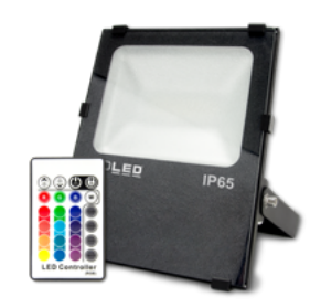
LED RGB floodlights