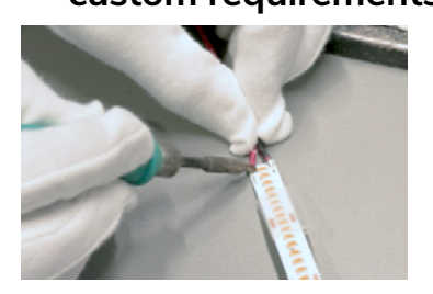
Assembly of LED flex stripes