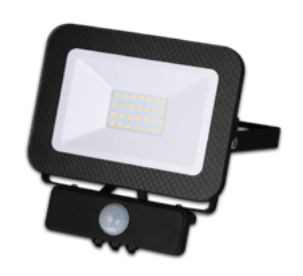
LED floodlights with motion sensor