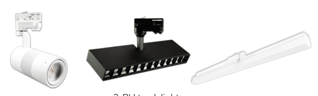
3-PH track lights