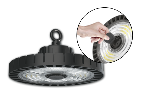
LED Highbay luminaires series MS