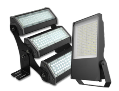
LED floodlights 5 year guarantee