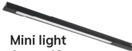
Mini light linear 42cm