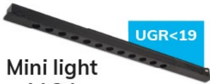
Mini light grid 34 cm